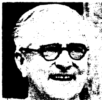
Dr. A. L. Rowse