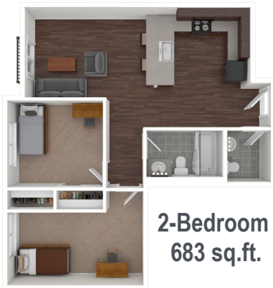
2-Bedroom 683 sq.ft.