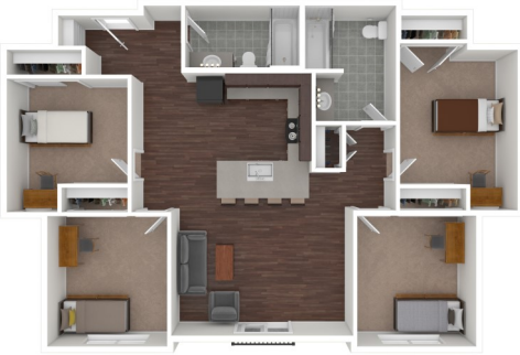
4-Bedroom (End) 1092 sq.ft.