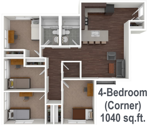
4-Bedroom (Corner) 1040 sq.ft.