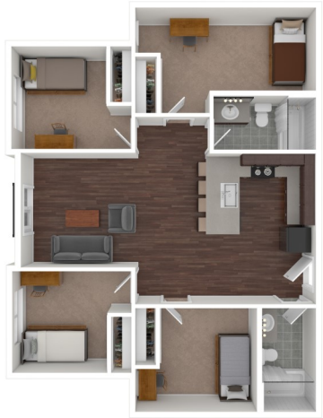
4-Bedroom (Center) 1029 sq.ft.