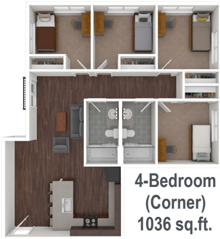
4-Bedroom (Corner) 1036 sq.ft.