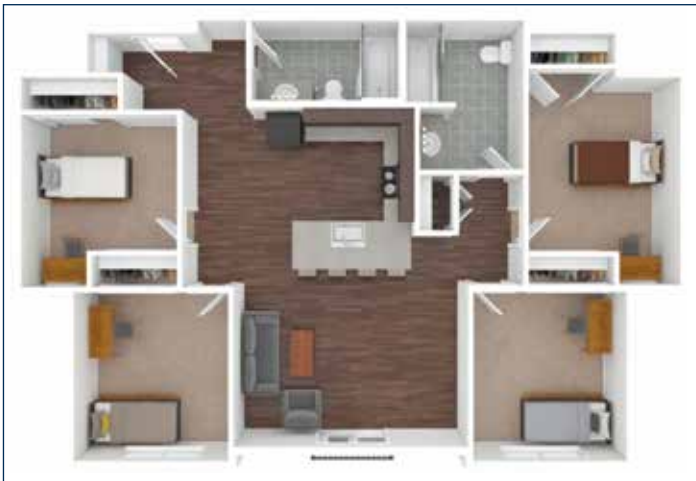
4-Bedroom (End)—1092 sq.ft.

Renderings are intended only as a general reference. Features, materials, finishes and layout of unit may be different than shown.