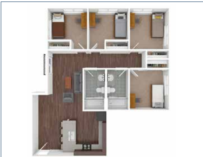
4-Bedroom (Corner)—1036 sq.ft.