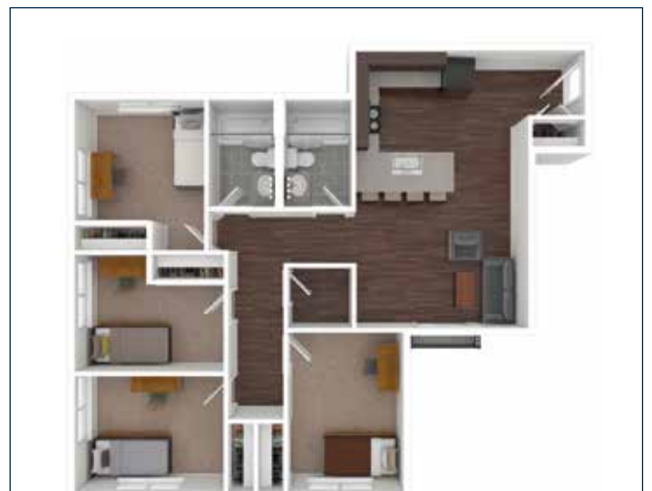
4-Bedroom (Corner)—1040 sq.ft.