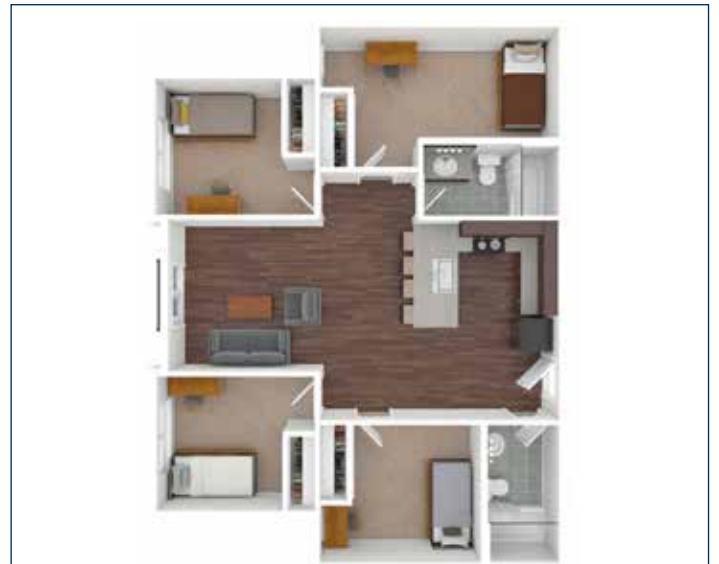
4-Bedroom (Center)—1029 sq.ft.